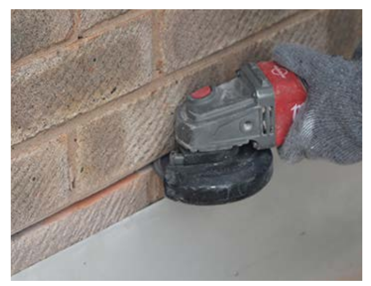
best suits your roof height, then the next step is to cut out the chase.

It is advised to cut the chase out before you overlay the existing substrate. This is done to ensure that all dust produced from the new chase out is cleared during the preparation stage. The surface should be completely cleaned before application of the main laminate as dust or debris left can lead to poor adhesion during the main laminate stage.